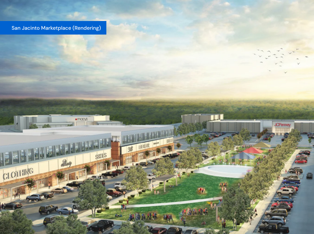
San Jacinto Marketplace (Rendering)