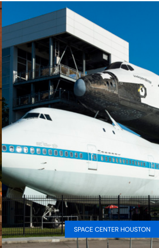
SPACE CENTER HOUSTON