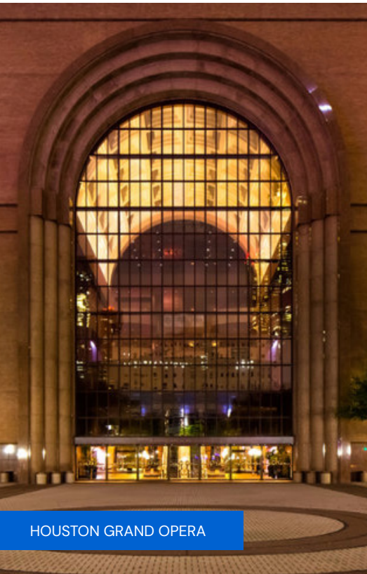
HOUSTON GRAND OPERA