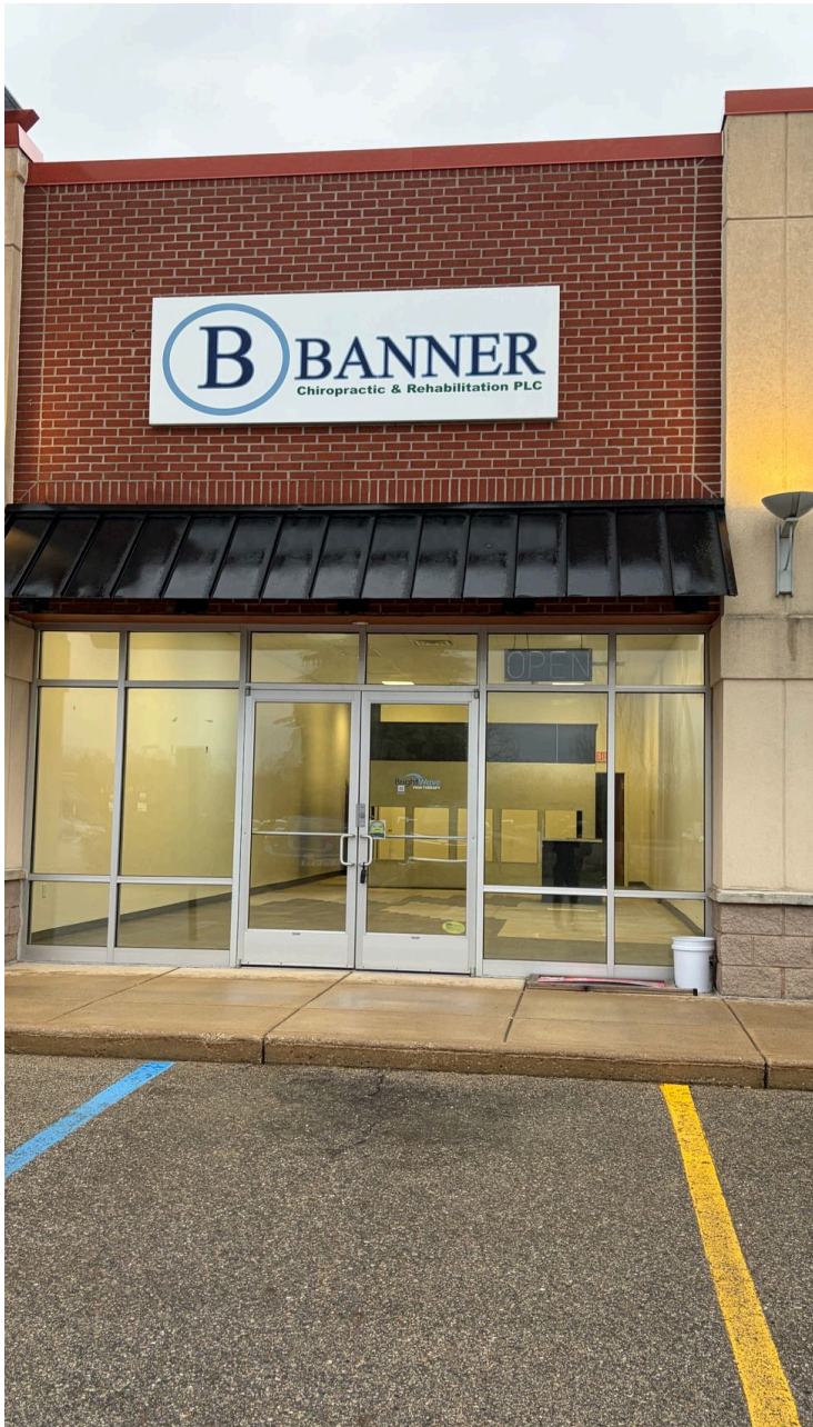
1,400 SF Suite