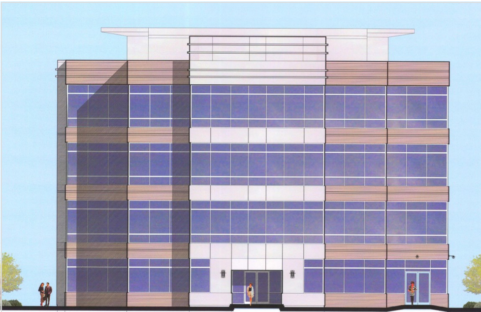
ODENTON HEALTH & TECHNOLOGY CAMPUS IN THE ODENTON TOWN CENTER.