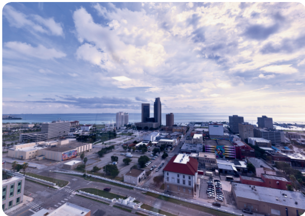
Bay Front View #2