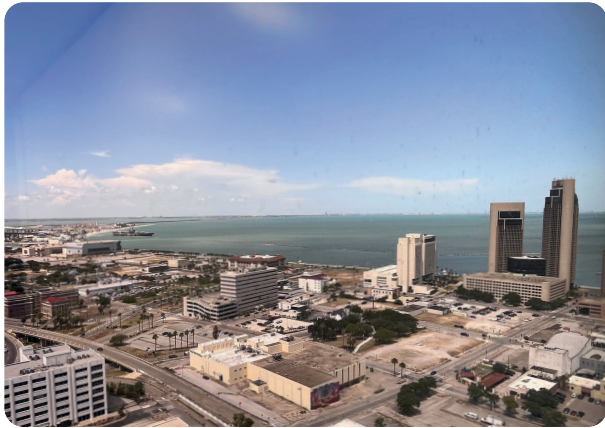
Bay Front View #1