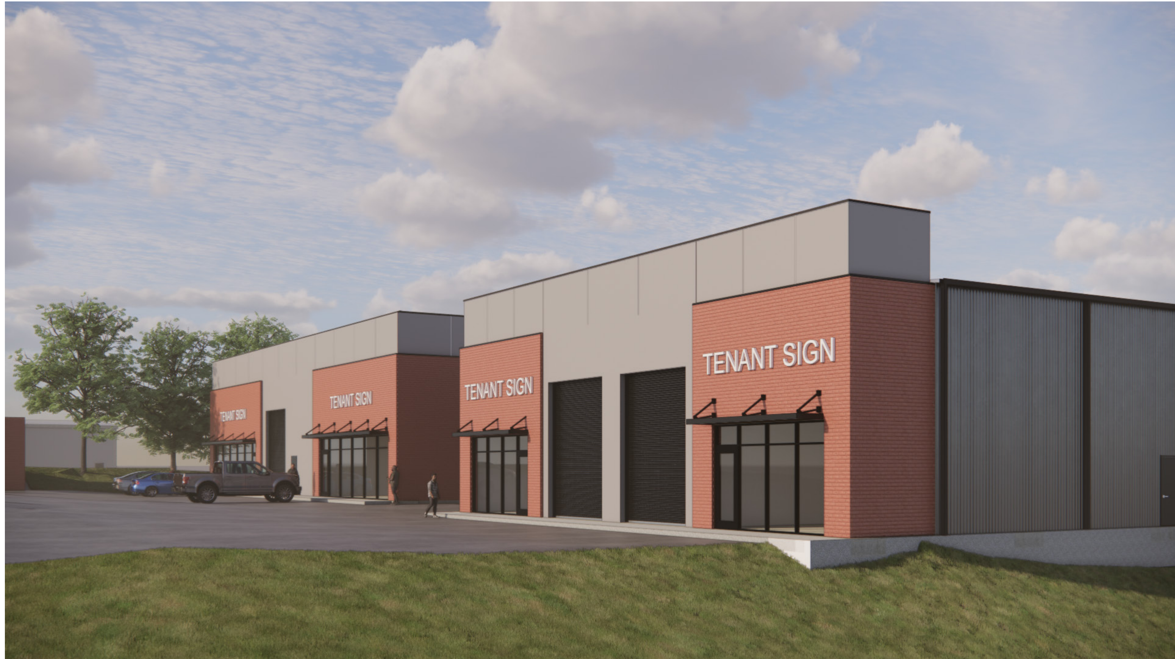
OPTION 1A EXTERIOR MASSING