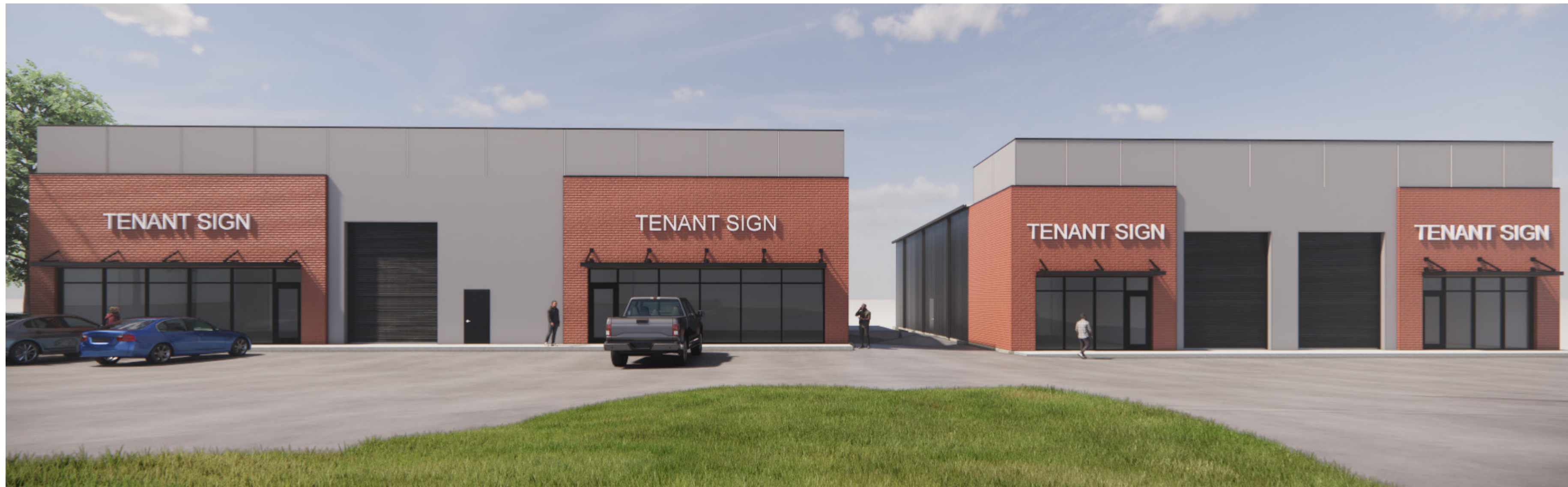
OPTION 1A EXTERIOR ELEVATIONS