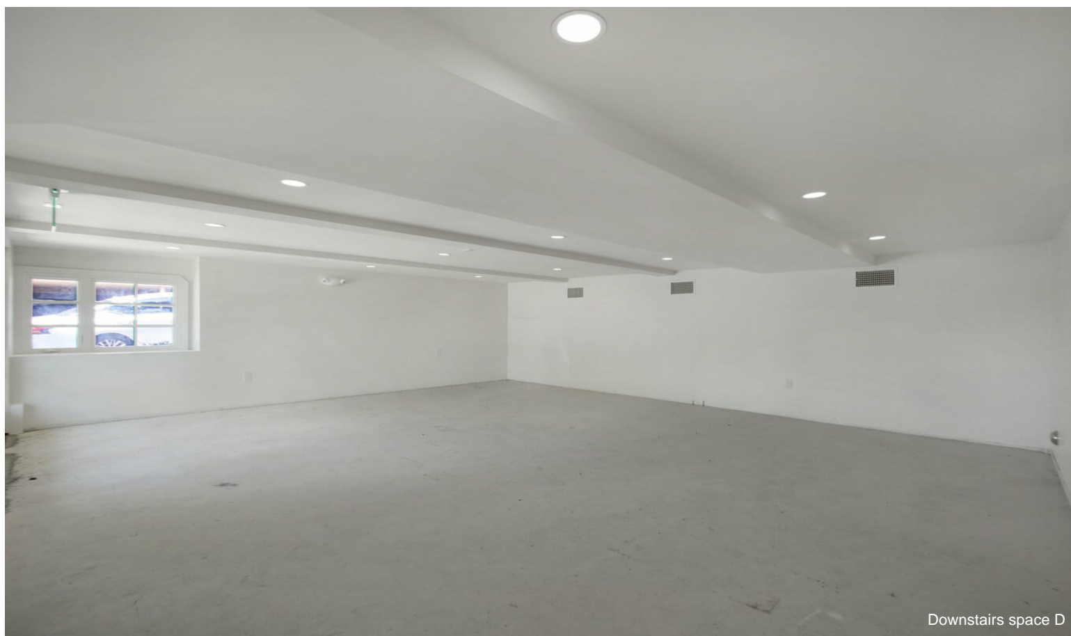
Downstairs space D