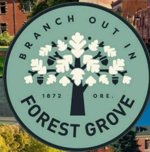
Downtown Forest Grove