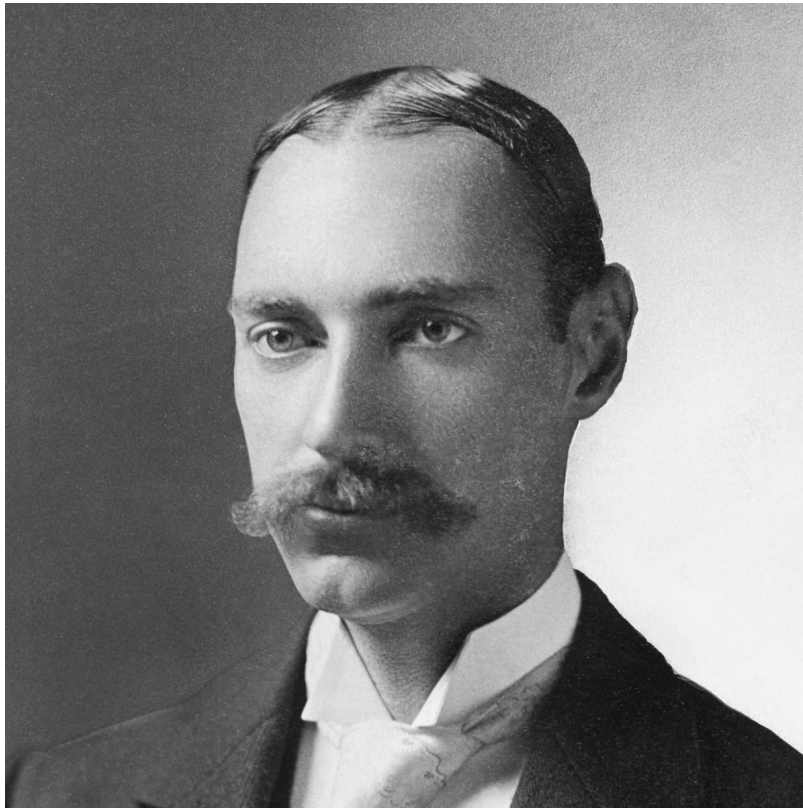
John Jacob Astor IV

Over its first 100 years, the property passed from owner to owner but none more distinctive than William Waldorf Astor, scion of John Jacob Astor, New York's original real estate magnate. With to his vast holdings, Astor IV was dubbed the "richest man in America". He and his cousin were the developers of the Waldorf-Astoria.