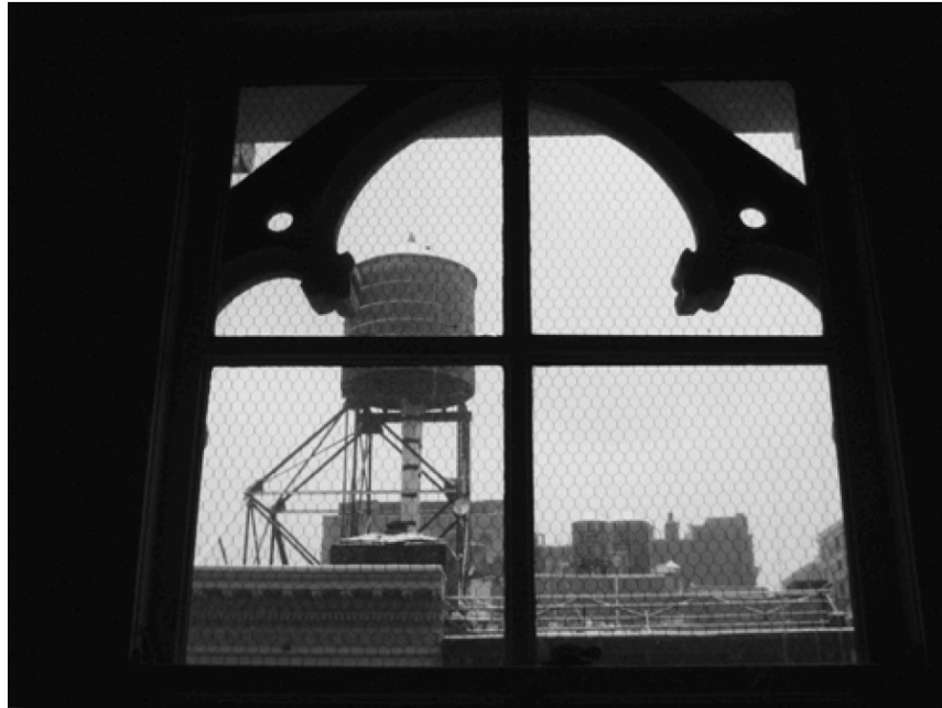
Broome Street Gothic

Unlike its palatial neighbor, The Haughwout Building that employs classical Greek and Roman architectural forms, Potter's Victorian-Gothic-Moderne literally and figuratively broke the mold.