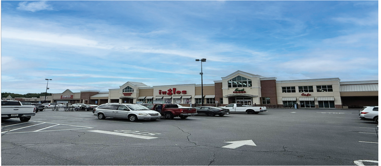
Riverstone Pkwy Canton , GA 30114

Small-Shop Opportunity in One of Canton's Most Established Retail Destinations.