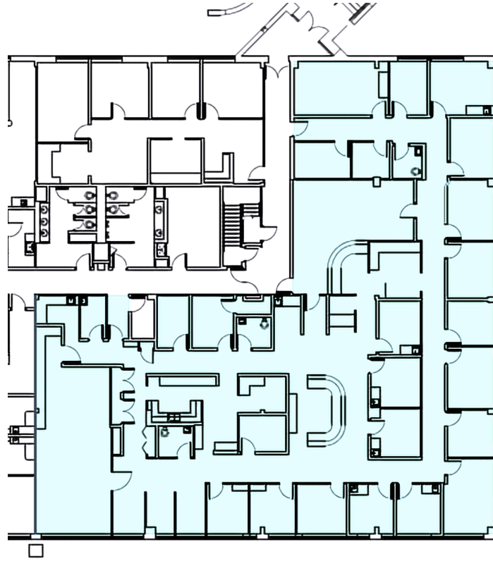
Suite 140/150 7,126 SF