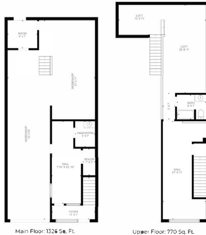
Main Floor: 1326 Sq. Ft.