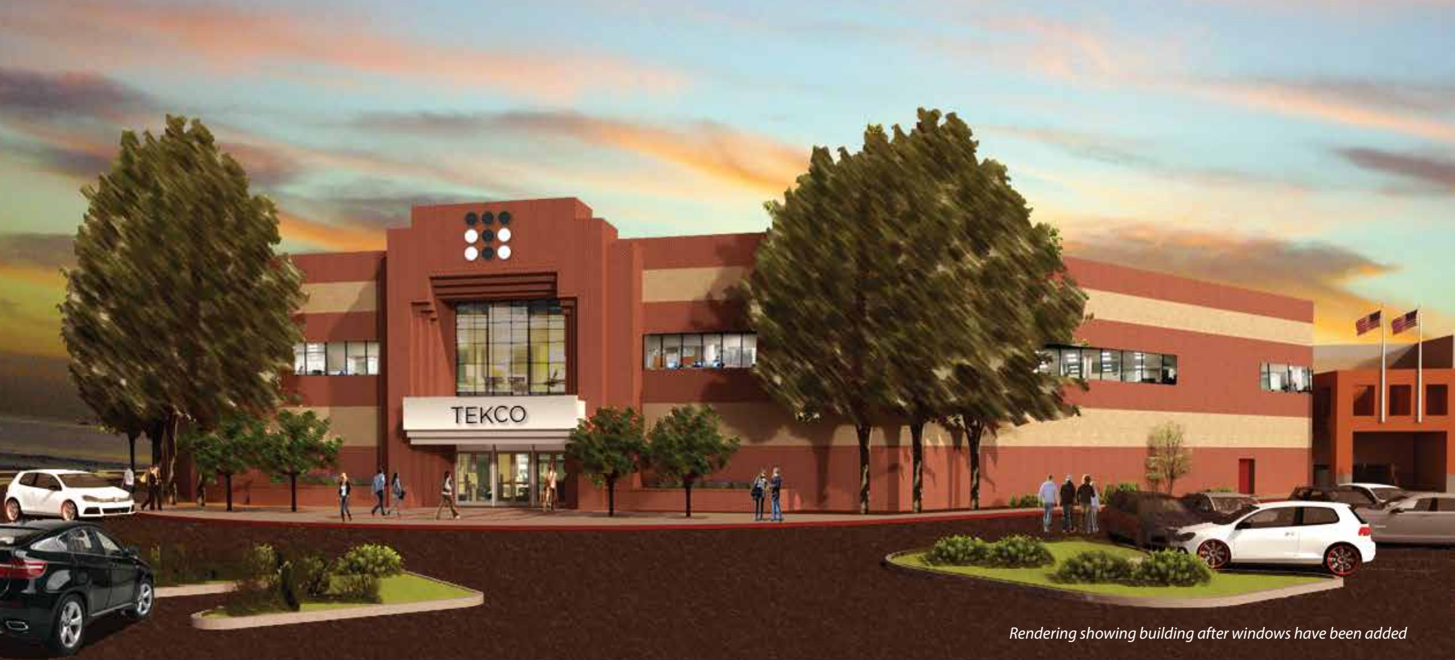
Rendering showing building after windows have been added