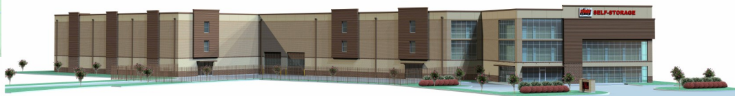
1 NE PERSPECTIVE VIEW NOT TO SCALE