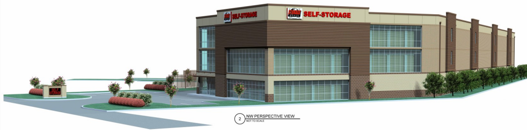
2 NW PERSPECTIVE VIEW NOT TO SCALE