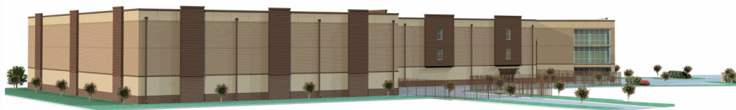
3 SE PERSPECTIVE VIEW NOT TO SCALE