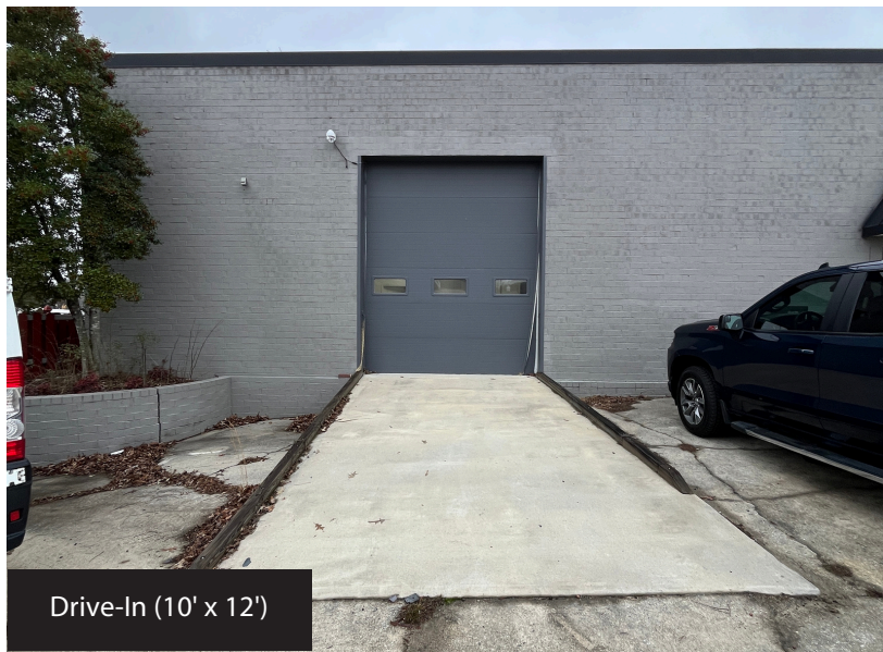
Drive-In (10' x 12')