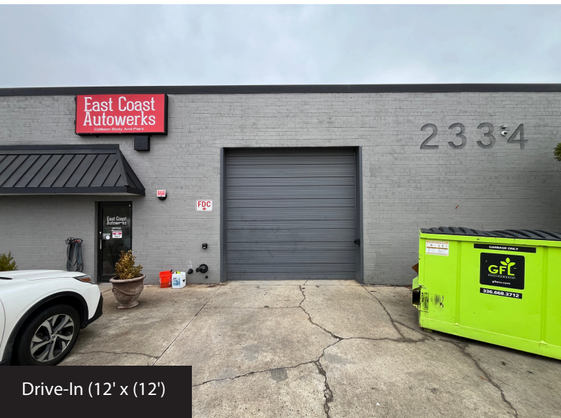
Drive-In (12' x 12')