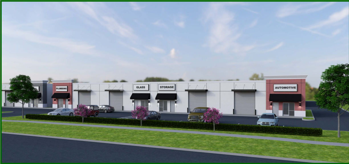
Building – C, Unit 221

40347 US Hwy 19, Tarpon Springs, FL 34689