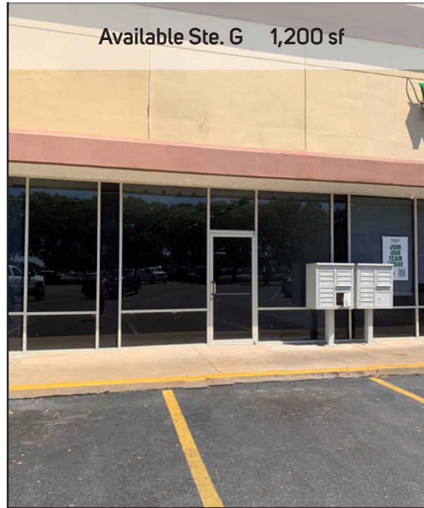
Available Ste. G 1,200 sf