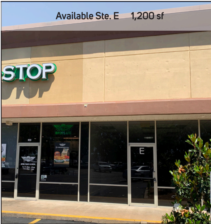
Available Ste. E 1,200 sf