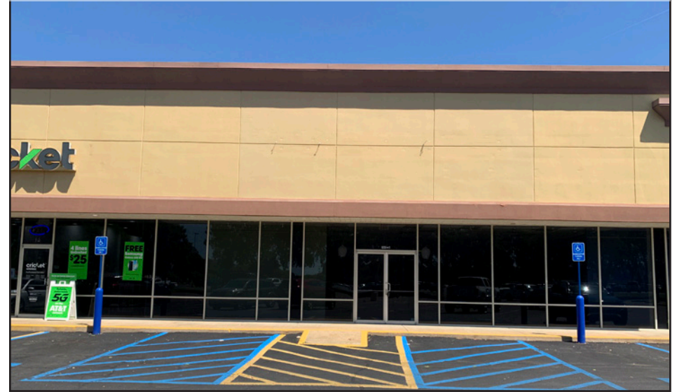
Available Ste. H&I 4,960 sf