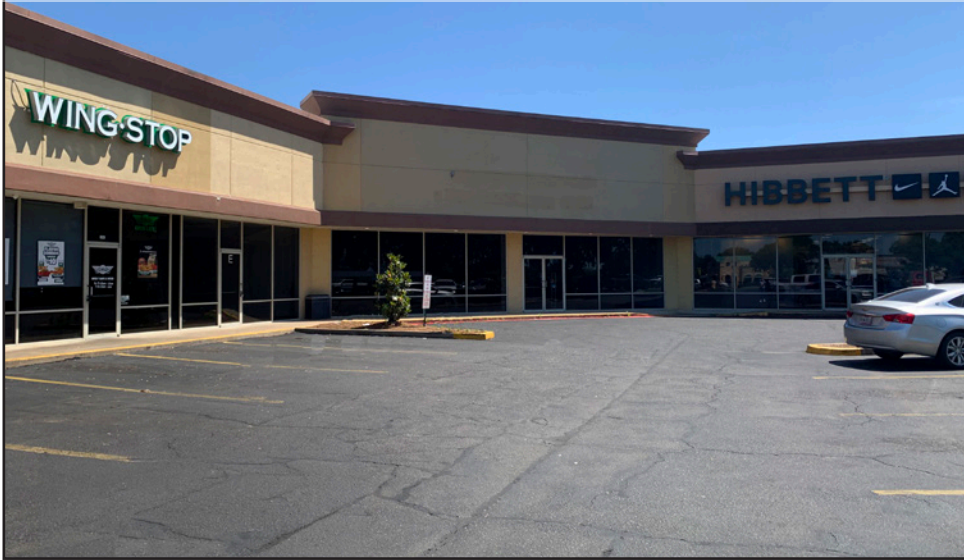
Available Ste. D 6,000 sf