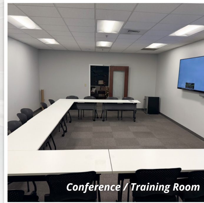
Conference / Training Room

10125 Berkeley Place Drive is a ±15,603 SF office building situated on ±4.089 acres in Charlotte, NC. Built in 2004 and zoned CC, the property offers a well-maintained, professional office environment with ample land and flexibility for a variety of office users. Its location provides convenient access to major interstates and surrounding business hubs, making it an ideal opportunity for owner-users or investors seeking a stable office presence in a strong Charlotte submarket.