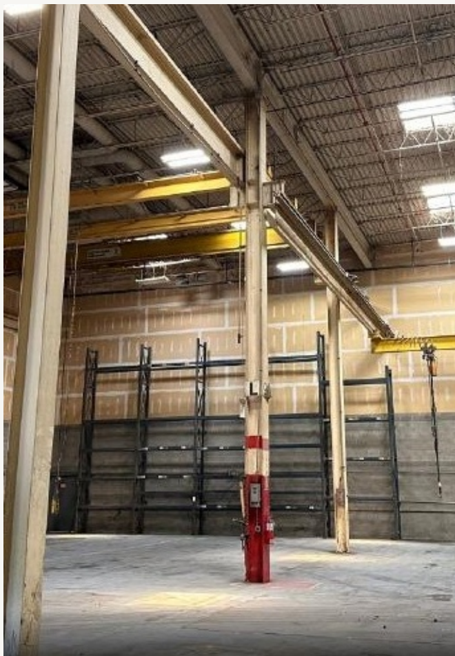
6,500 SF high bay with overhead crane — 21' clear