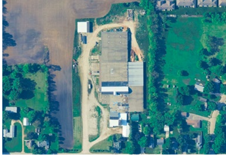
Pictured: Aerial Overview

This property is immediately accessible by truck routes. Located 22 miles from I-88 to the North and I-39 to the West. Available space for sale includes a total of 120,402 SF of warehouse, showroom and office space. Additional 14,400 SF loft space with conveyor belt access also available. Twenty (20) existing truck and trailer stalls, expandable.