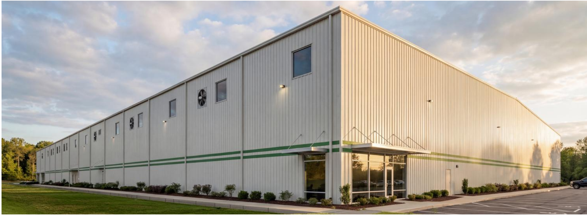
PENDER COMMERCE PARK | 353 ACME WAY | WILMINGTON