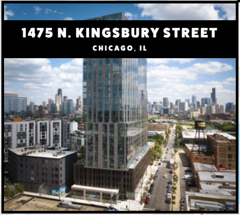
1475 N. KINGSBURY STREET CHICAGO, IL

GOOSE ISLAND SLATED FOR LARGE OFFICE DEVELOPMENT