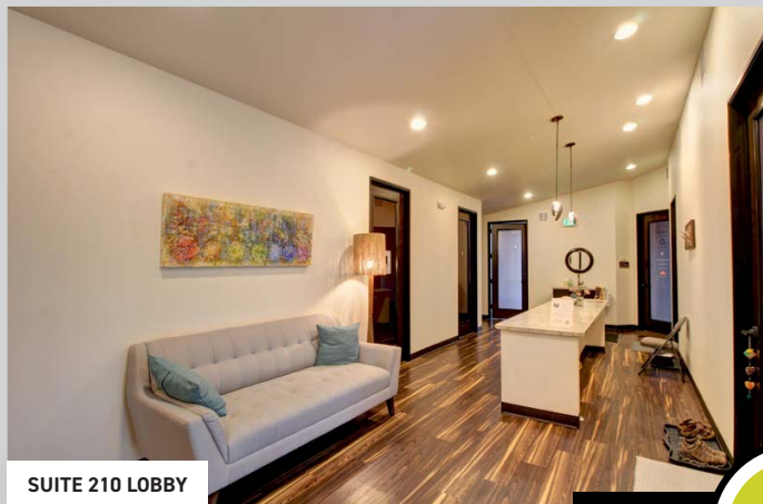
SUITE 210 LOBBY