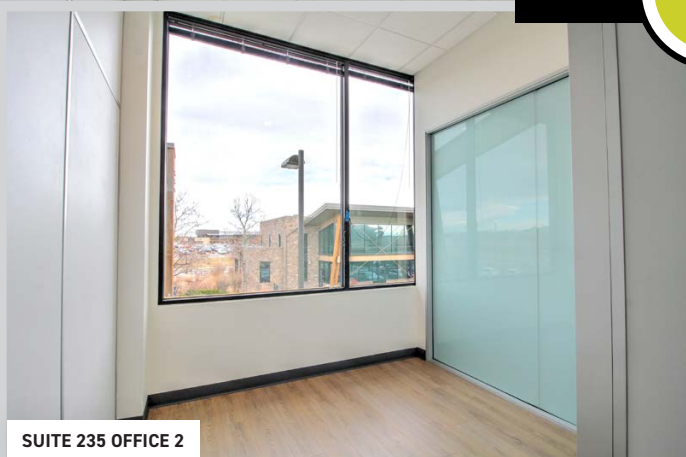
SUITE 235 OFFICE 2