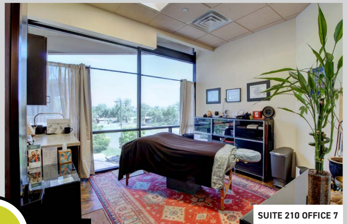
SUITE 210 OFFICE 7