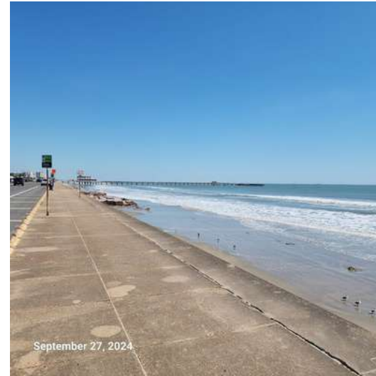
A view from the Galveston seawall on a bright, sunny day, looking down the coastline with a long fishing pier in the distance.