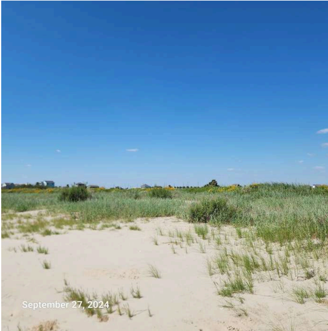
A close-up, ground-level photo of the natural sand dunes and sparse beach grass on the property, showing the authentic coastal environment under a vast blue sky.