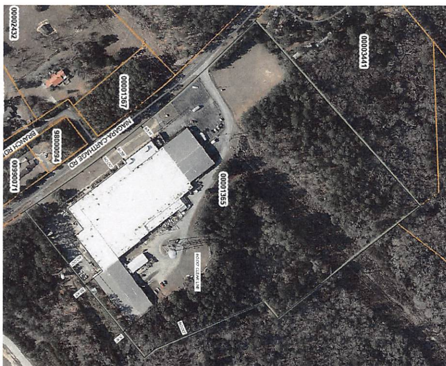
1 GIS Layout 1" = 500'