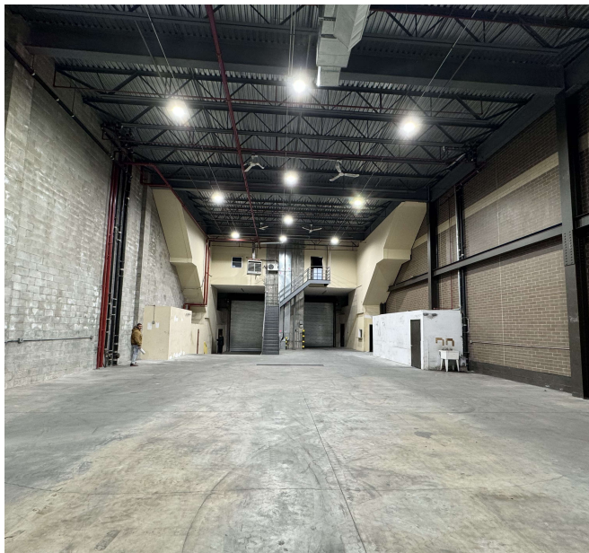
Warehouse — Column-Free