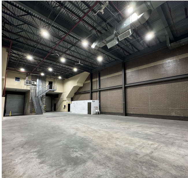
Interior — Loading End