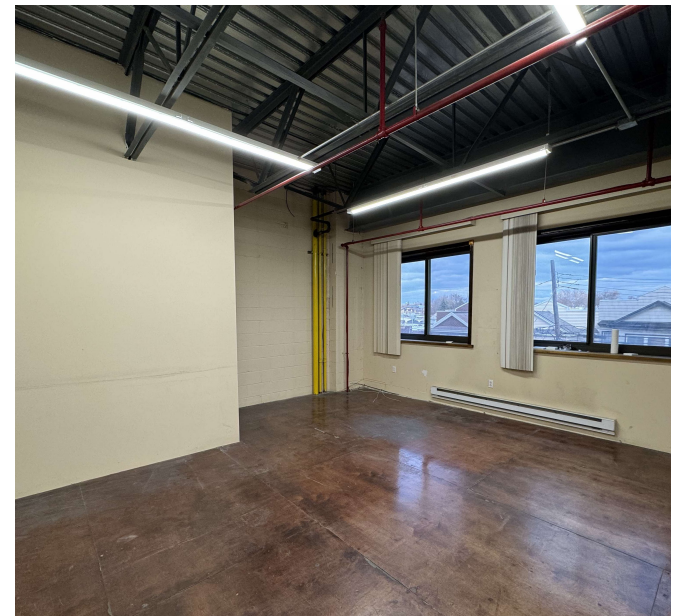
Office Mezzanine — Windows