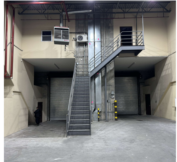
Loading Docks & Mezzanine Stairs