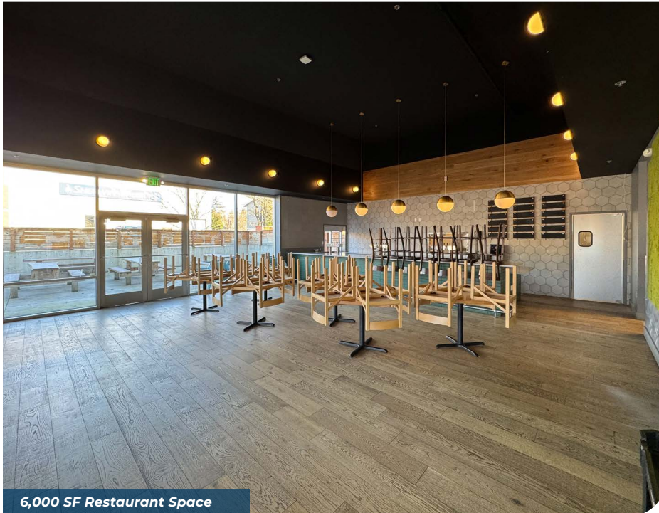
6,000 SF Restaurant Space