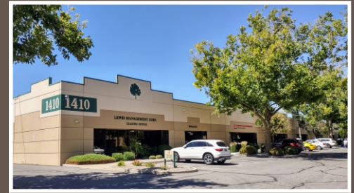
Sample Park Photos