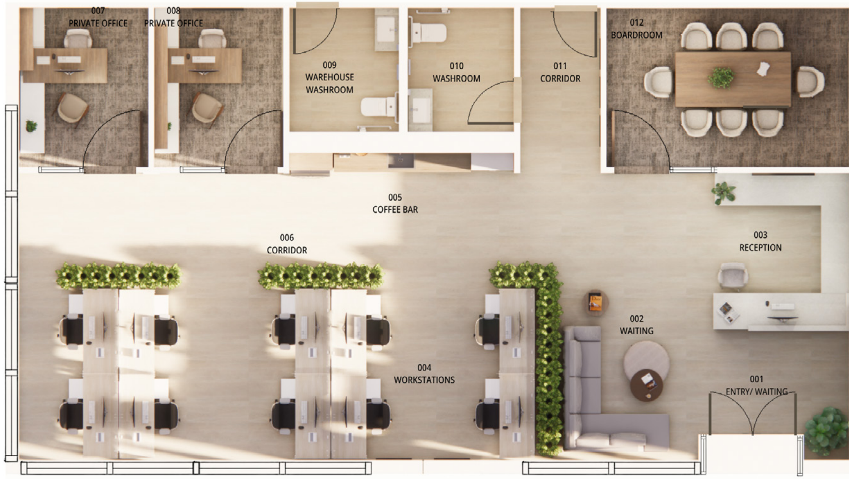
UNIT 114 - 1,861 SF