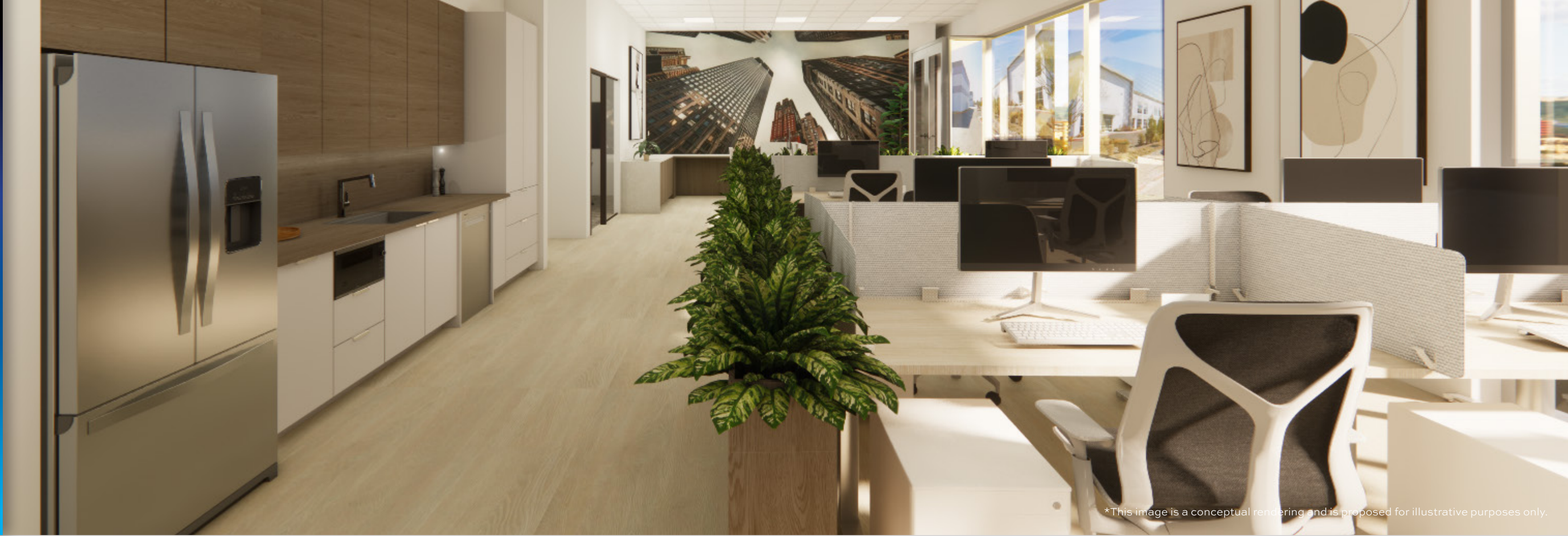
*This image is a conceptual rendering and is proposed for illustrative purposes only.