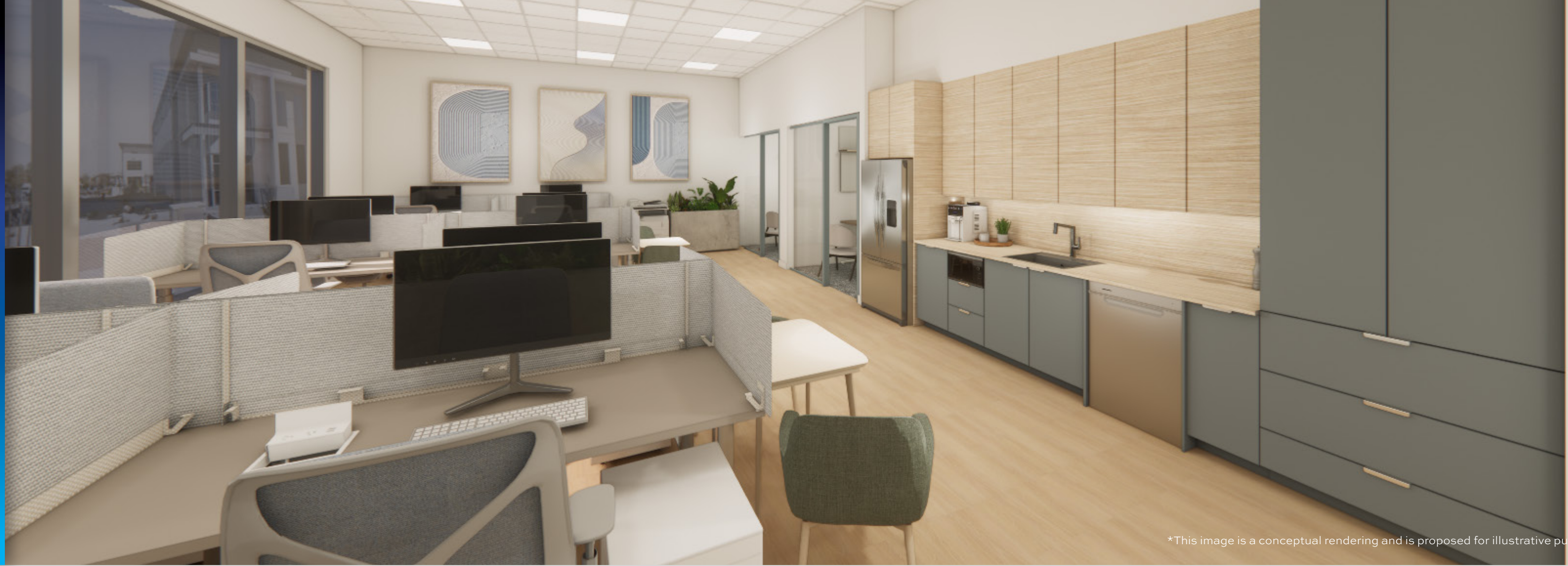
*This image is a conceptual rendering and is proposed for illustrative purposes only.