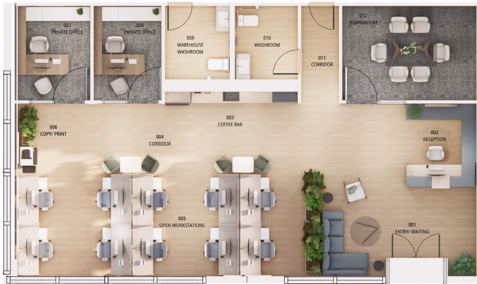
UNIT 123 - 1,732 SF