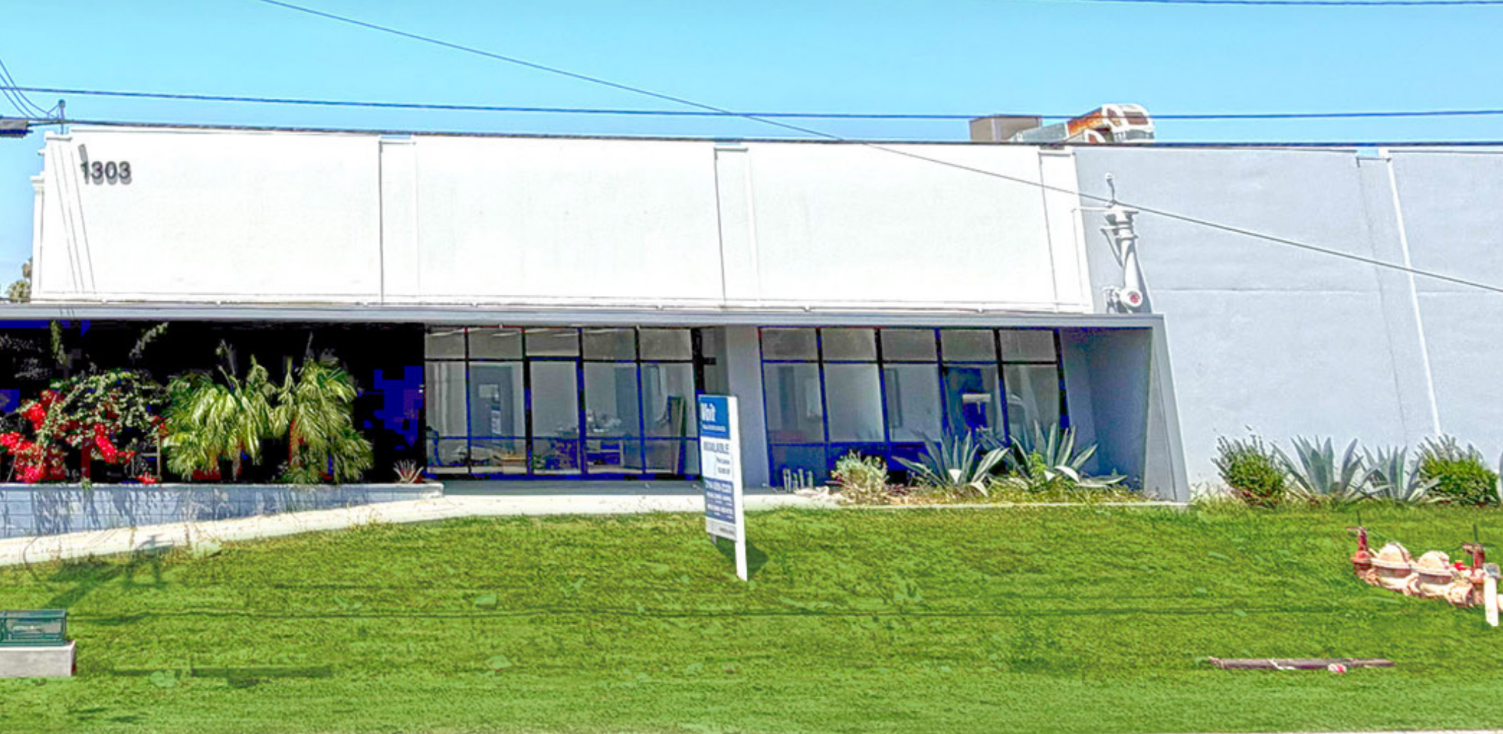
Image has been digitally modified. The depiction is for visualization purposes only and may not reflect actual property conditions. Original image available upon request.

NEWLY REFURBISHED INSIDE & OUT • NEW ROOF • NEW OFFICES LEASE RATE REDUCED