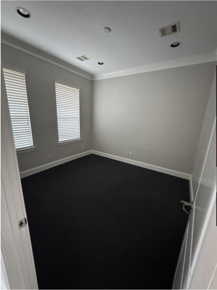
PRIVATE OFFICE (EXAMPLE)