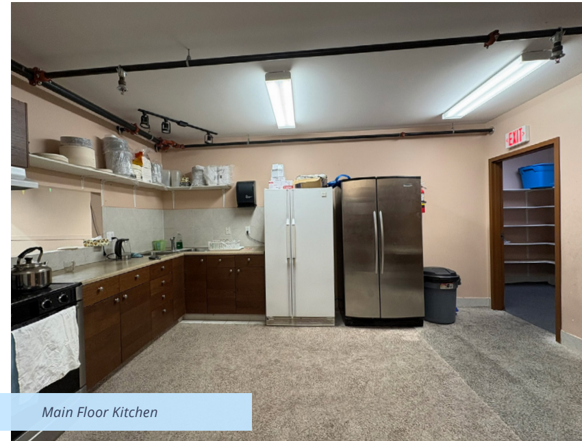
Main Floor Kitchen