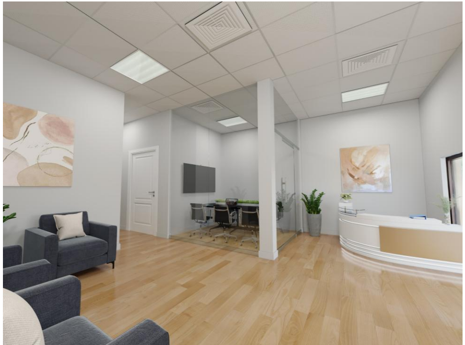
IMAGES HAVE BEEN VIRTUALLY STAGED TO BETTER SHOWCASE THE POTENTIAL OF THE SPACE AND ARE NOT REPRESENTATIVE OF ACTUAL INTERIOR.