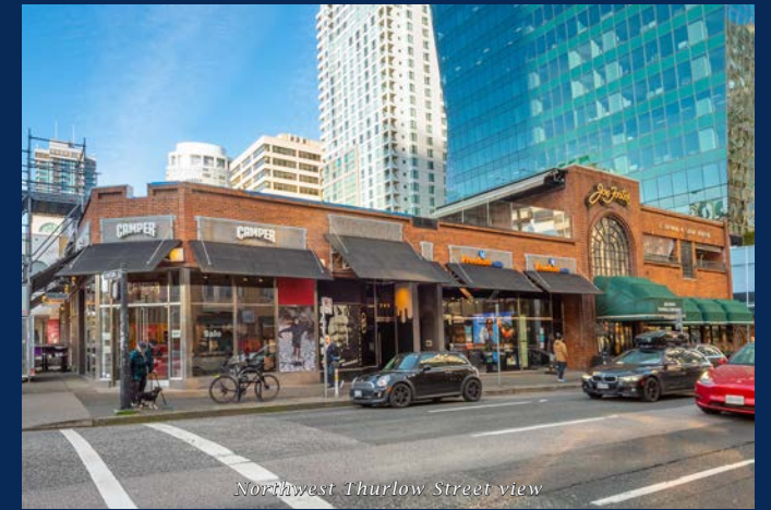
Northwest Thurlow Street view