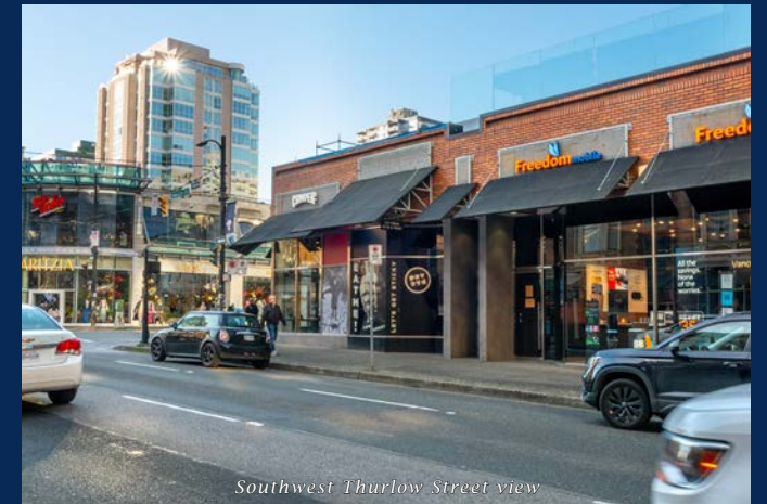
Southwest Thurlow Street view