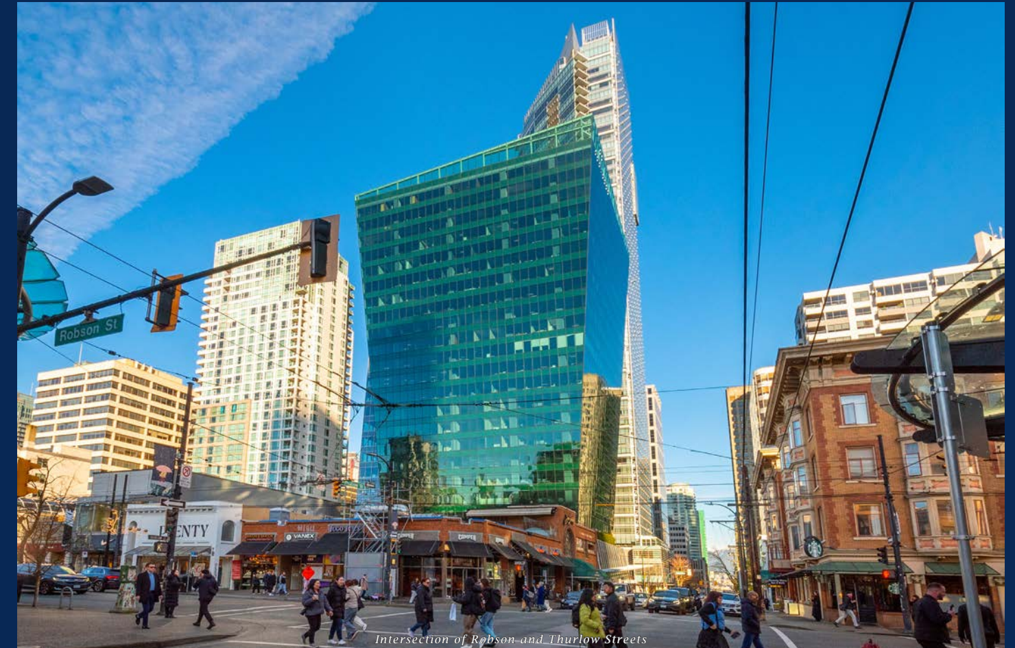
Intersection of Robson and Thurlow Streets