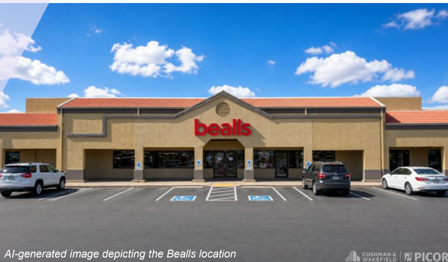
AI-generated image depicting the Bealls location