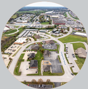
LOCATED NEAR PRIME RETAIL AREA