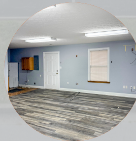
CLEAN, OPEN WORK SPACE