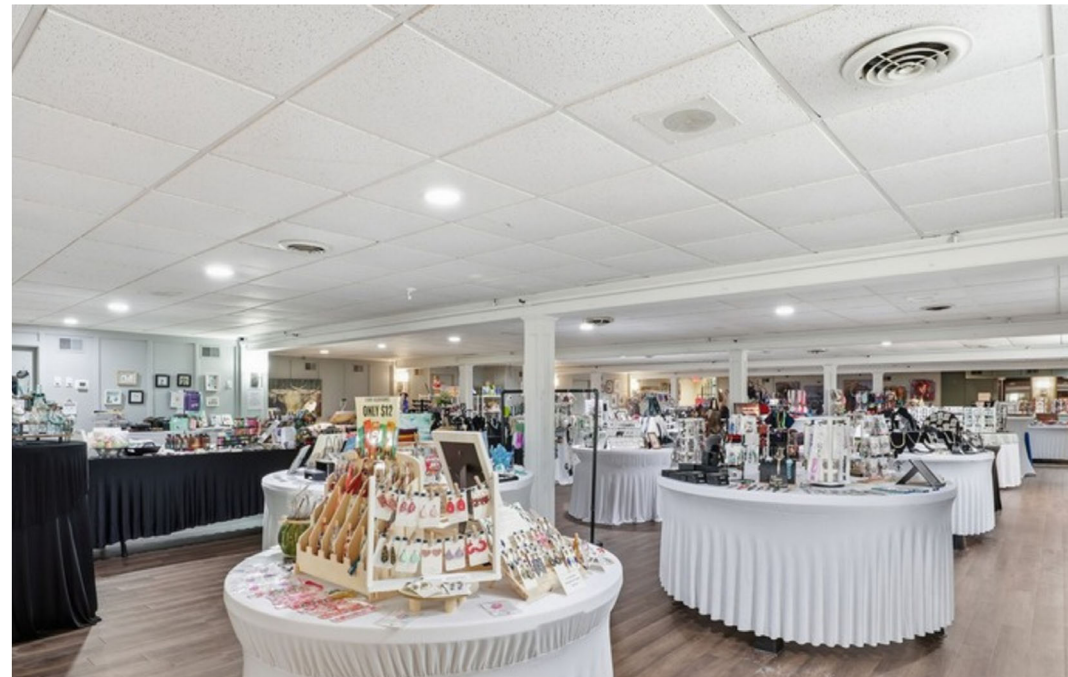
THE DELAND HOUSE ON MAIN