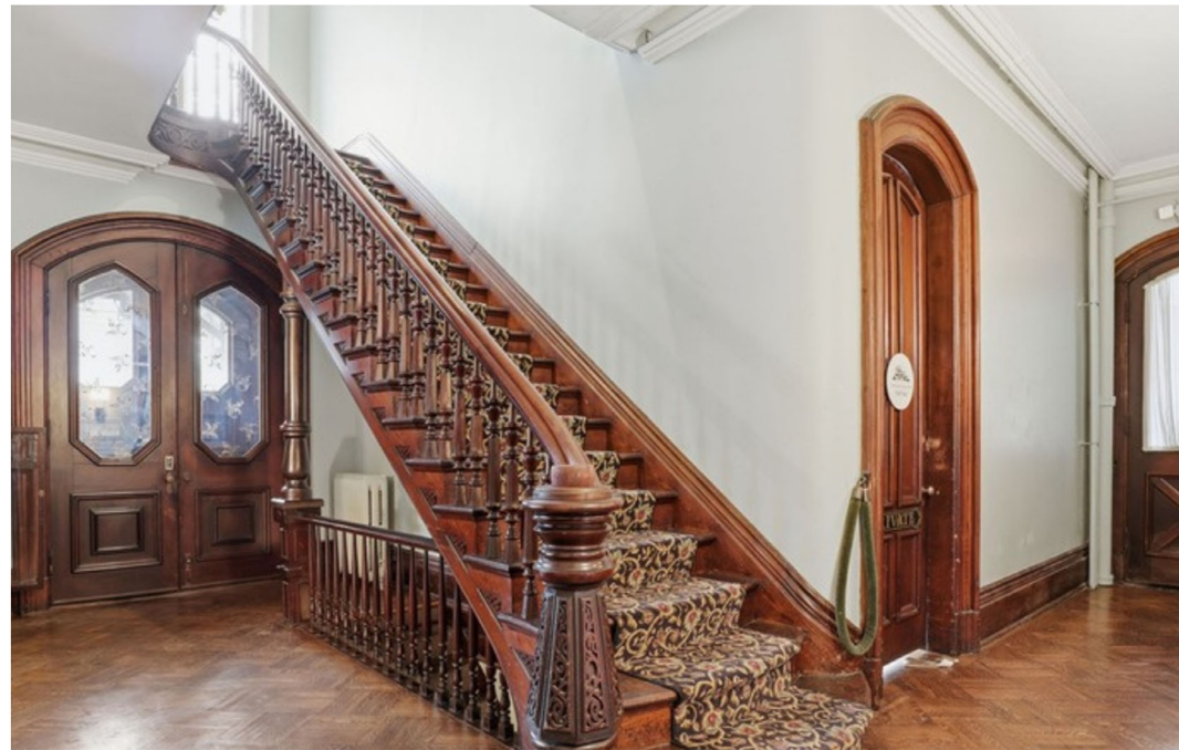
THE DELAND HOUSE ON MAIN