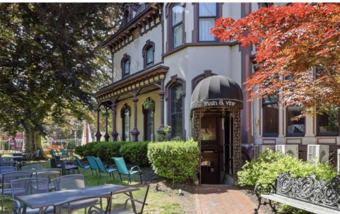
THE DELAND HOUSE ON MAIN