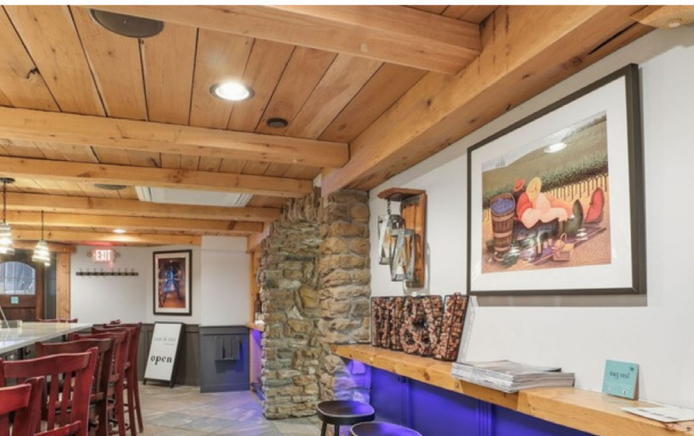
THE DELAND HOUSE ON MAIN