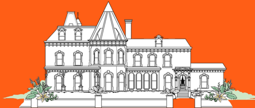
The DeLand House on Main