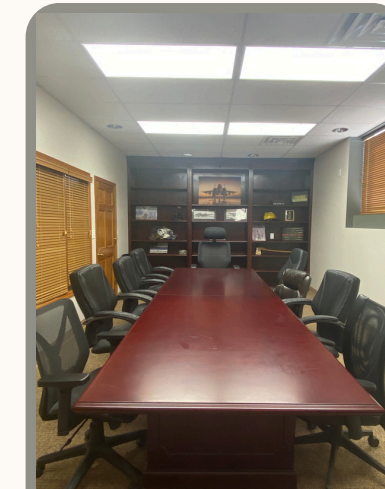
Corporate Meeting Room