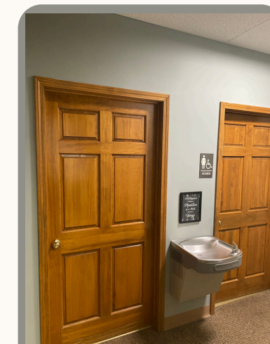
Two Private Restrooms