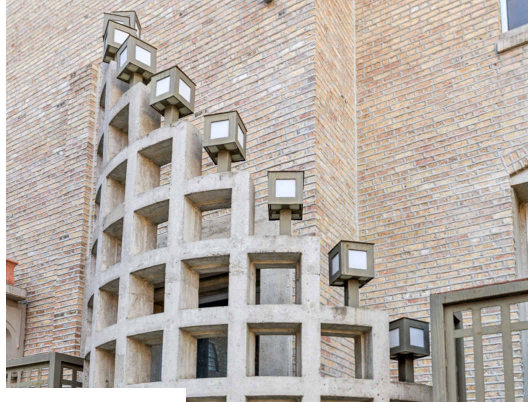
165 N MAY — EXTERIOR