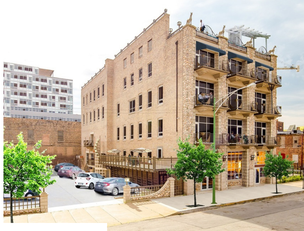
165 N MAY — EXTERIOR