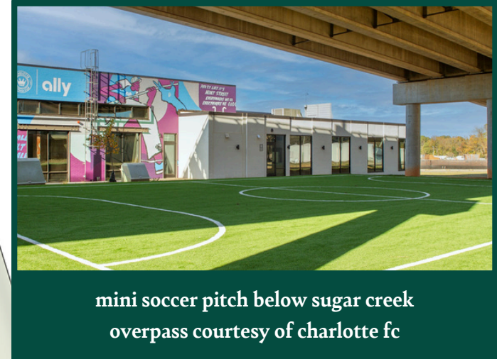
mini soccer pitch below sugar creek overpass