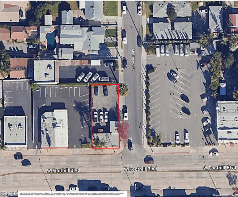
333 WEST FOOTHILL BLVD, MONROVIA