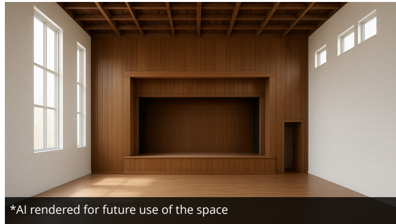
*AI rendered for future use of the space