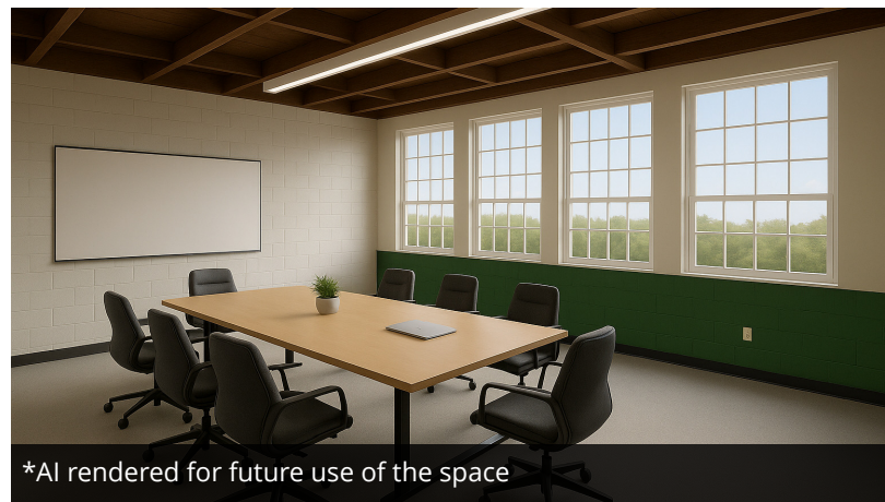
*AI rendered for future use of the space