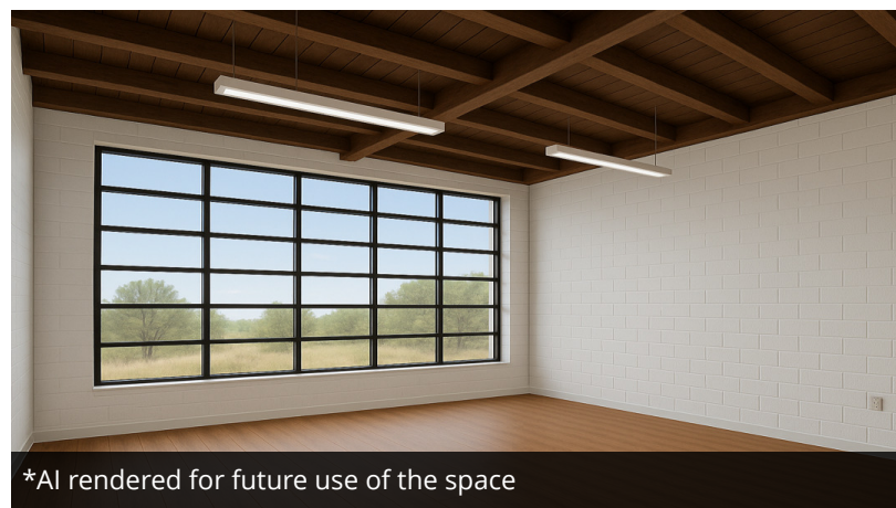
*AI rendered for future use of the space