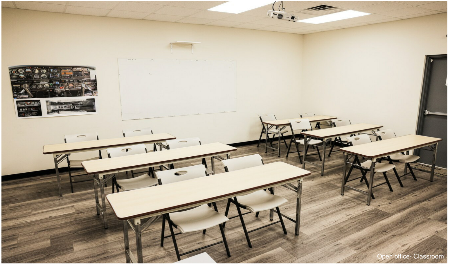
Open office- Classroom