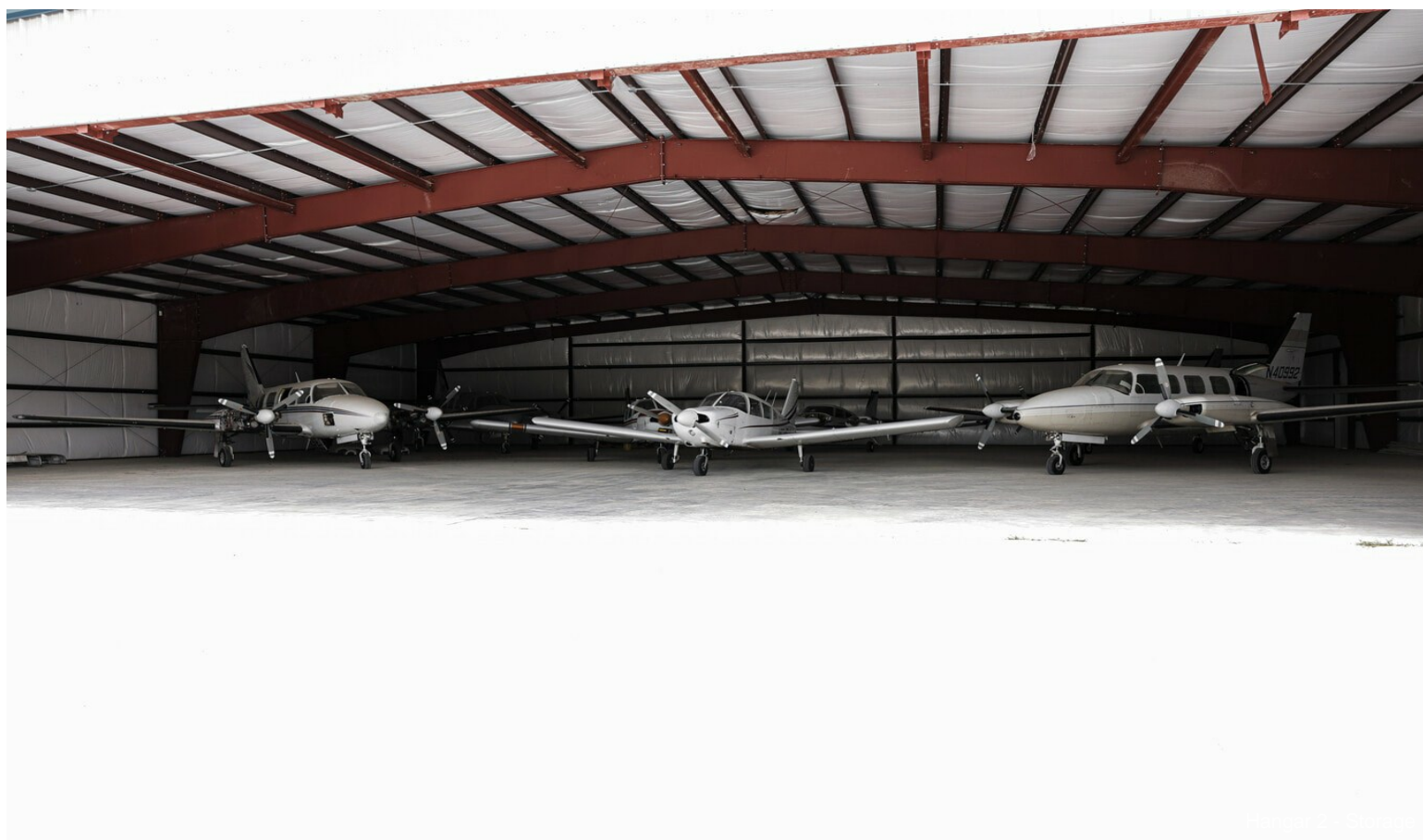
Hangar 2 - Storage