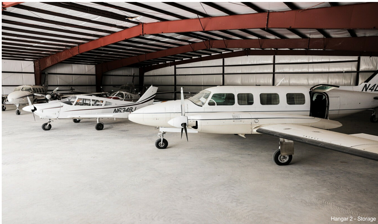
Hangar 2 - Storage