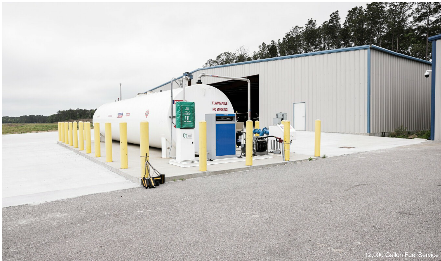
12,000 Gallon Fuel Service