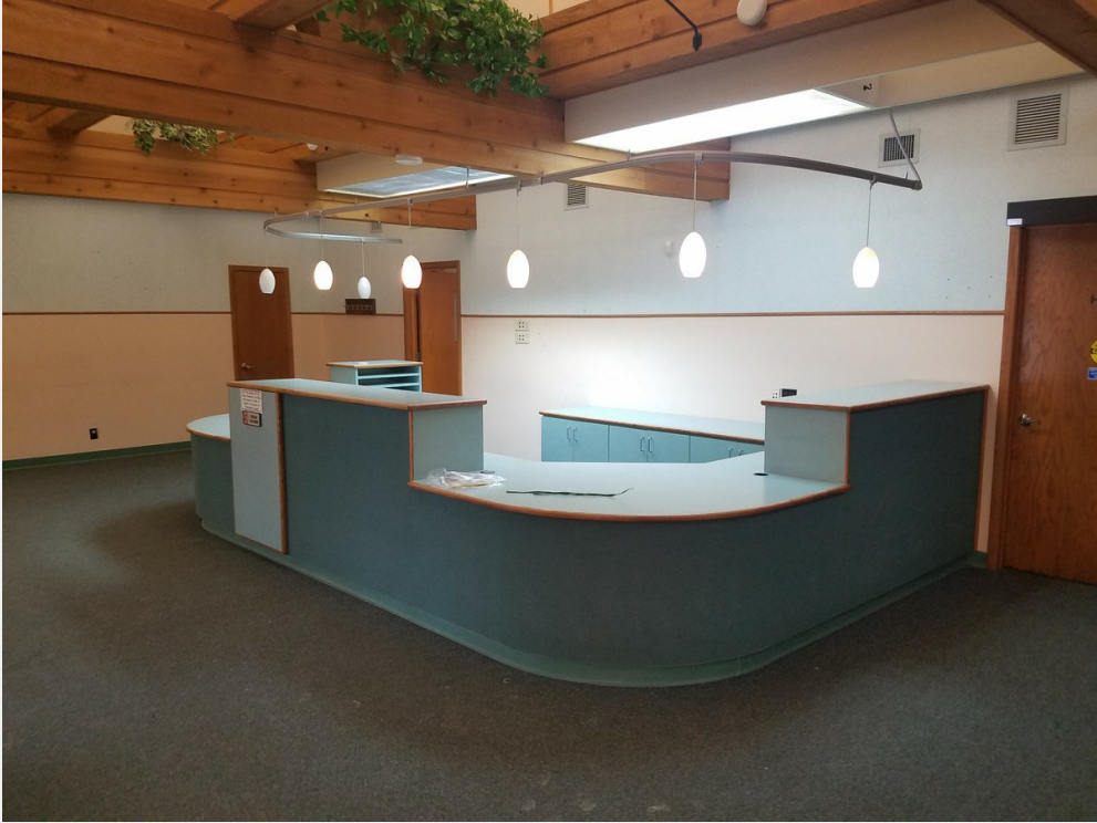
Main Reception Desk Area