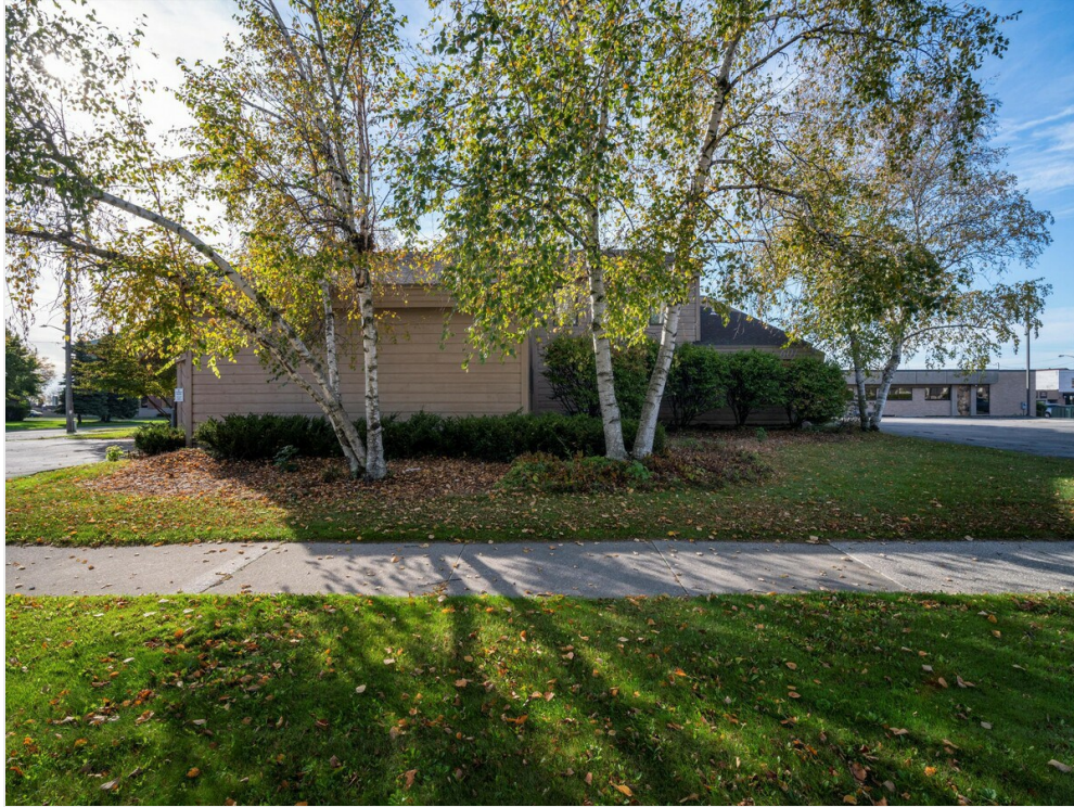
North Side view of building