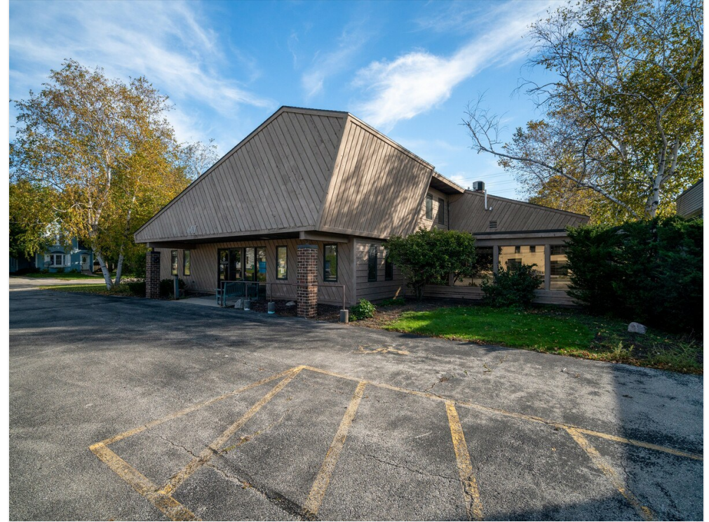
Front & South Side View