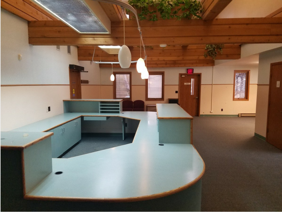
Main Reception Desk