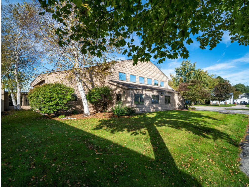
East View of building & yard