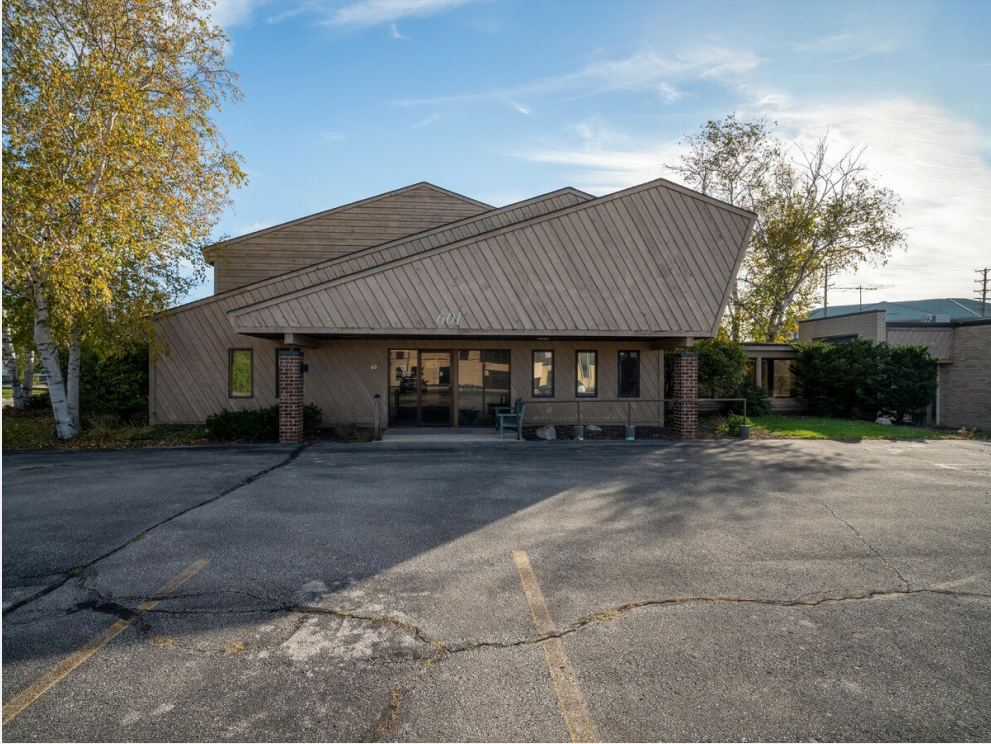
Main Front Photo