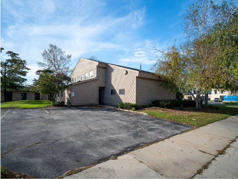
Back View of Building & Parking Area