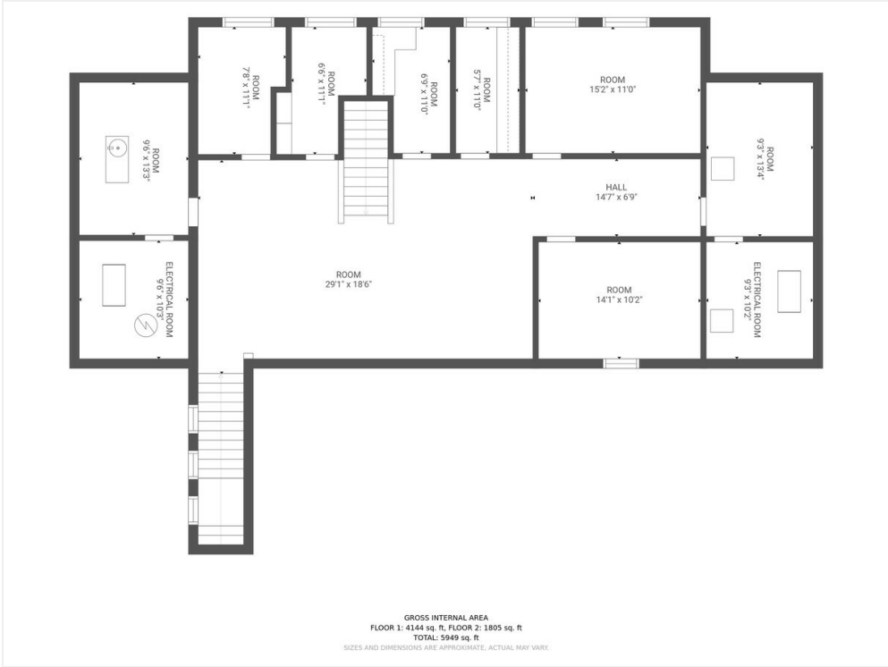
Upper level Floor Plan