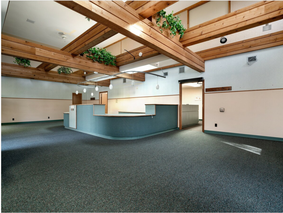
Reception Area Photo