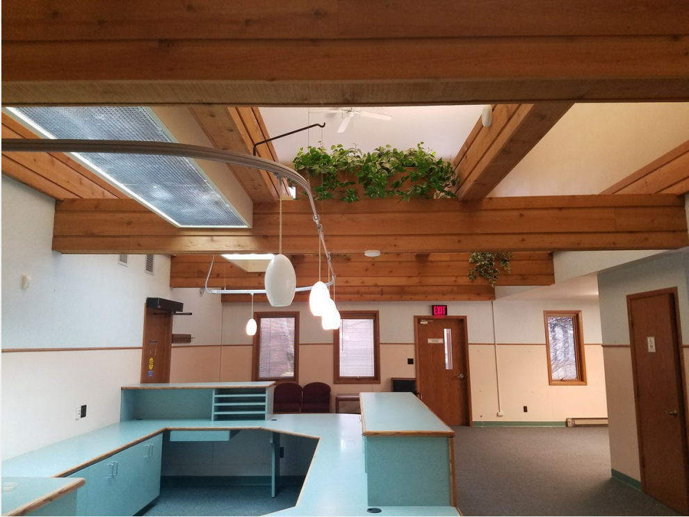
Main Reception Desk