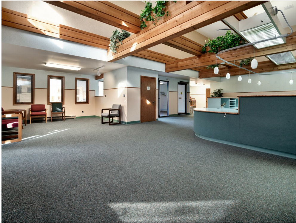
Main Waiting Area in front