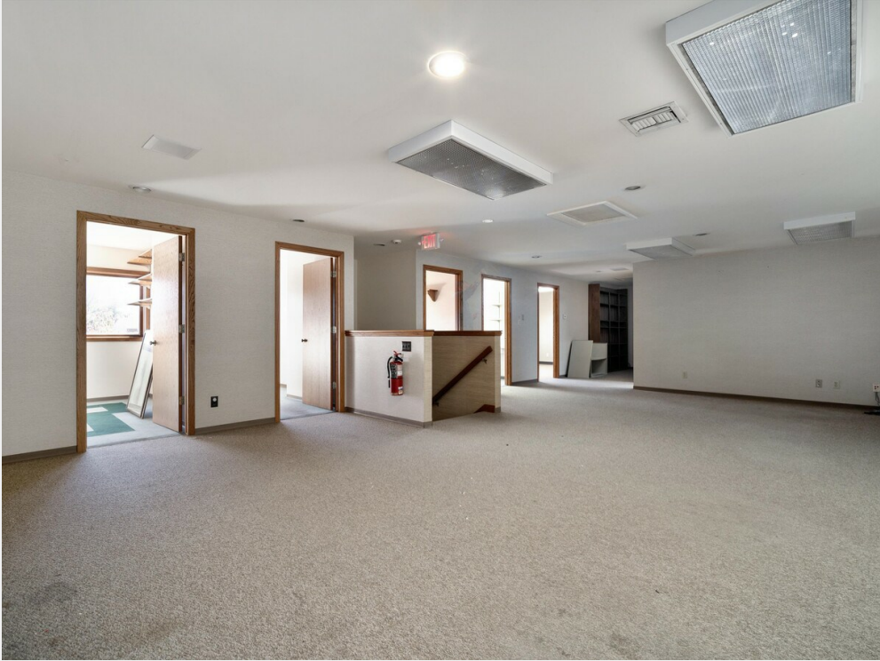
Upper Level View to individual office spaces