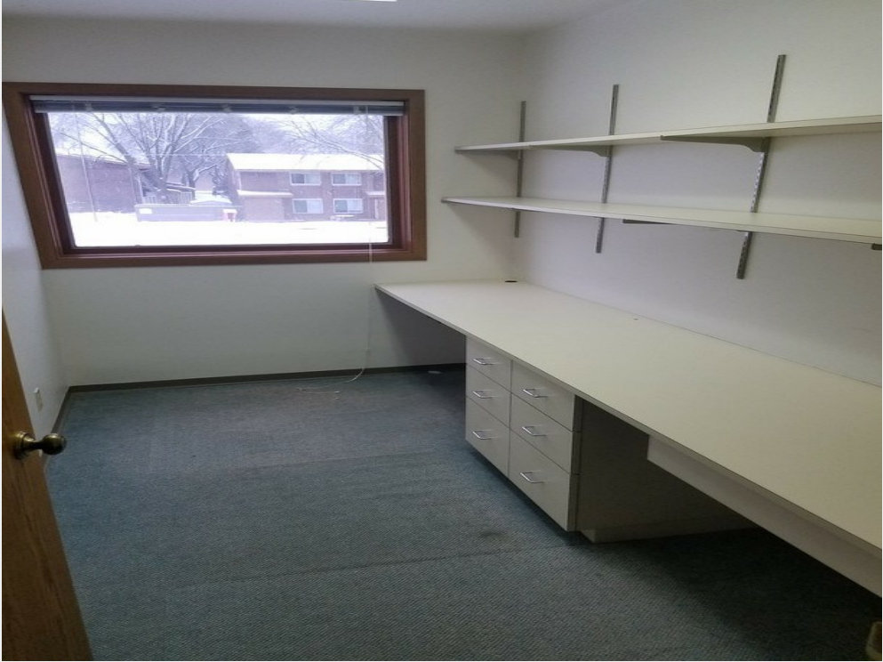
Private store room