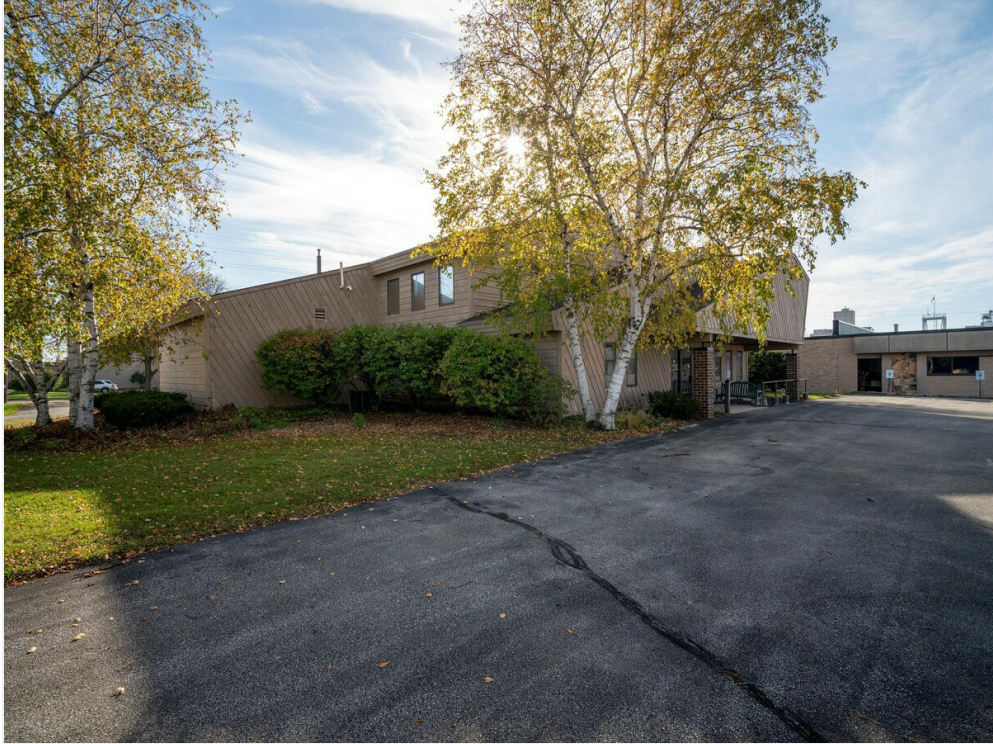
Front & North Side View