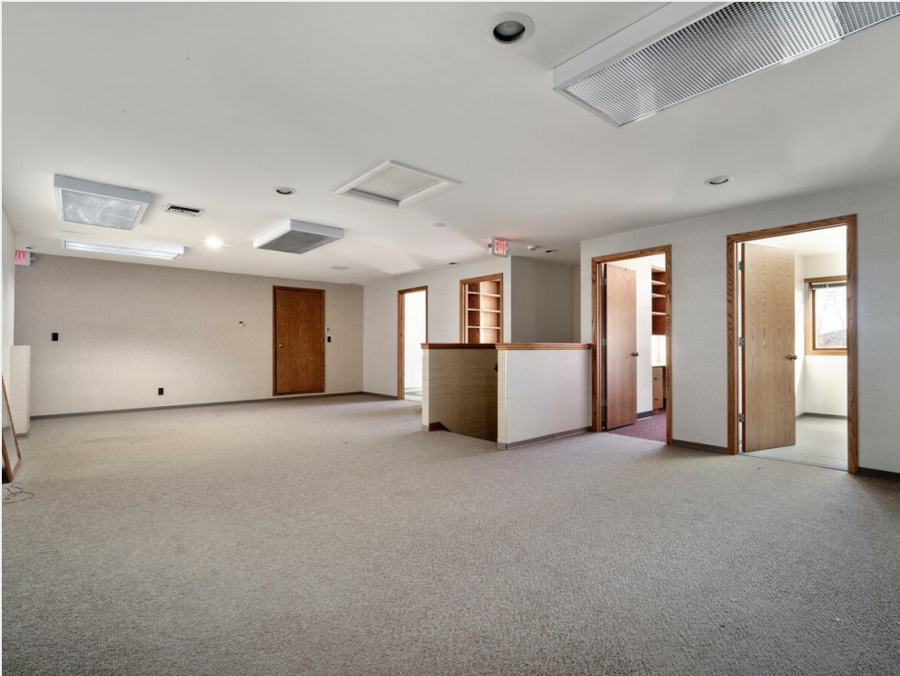
Upper Level Area View