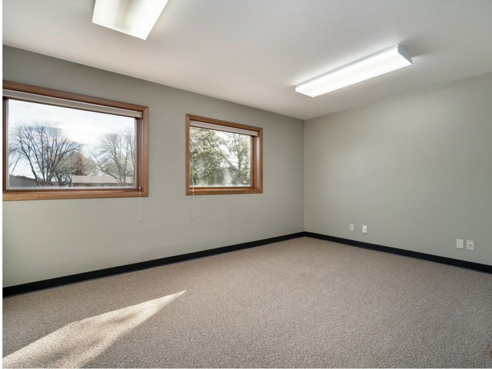
Upper Level Room