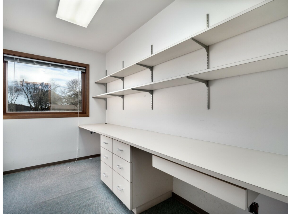
Upper Level Storage Room