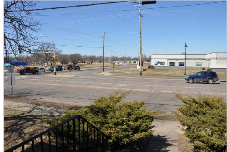
View from Front Door

This information has been secured from sources we believe to be reliable, but we make no representations or warranties explained or implied as to the accuracy of the information. Buyer must verify the information and bears all risk for any inaccuracies.