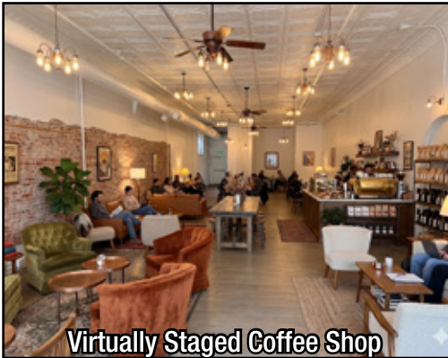
Virtually Staged Coffee Shop