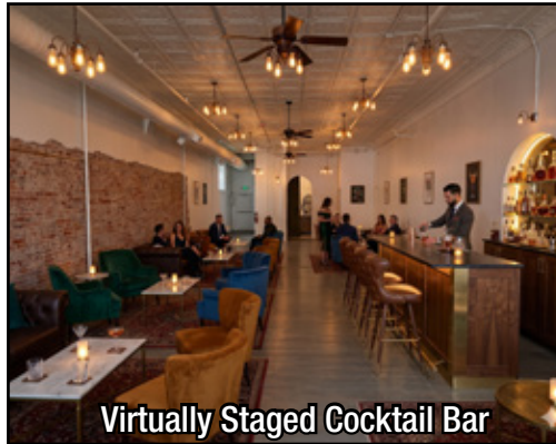
Virtually Staged Cocktail Bar