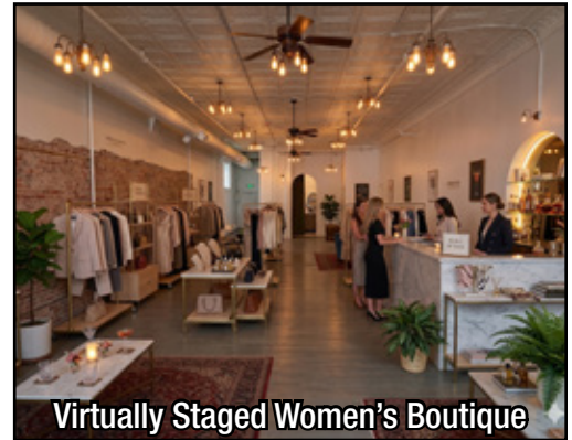
Virtually Staged Women's Boutique