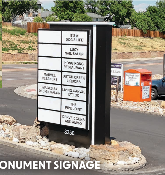
NEW MONUMENT SIGNAGE