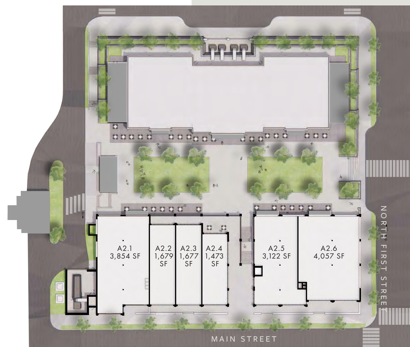
MAIN ST. LEVEL