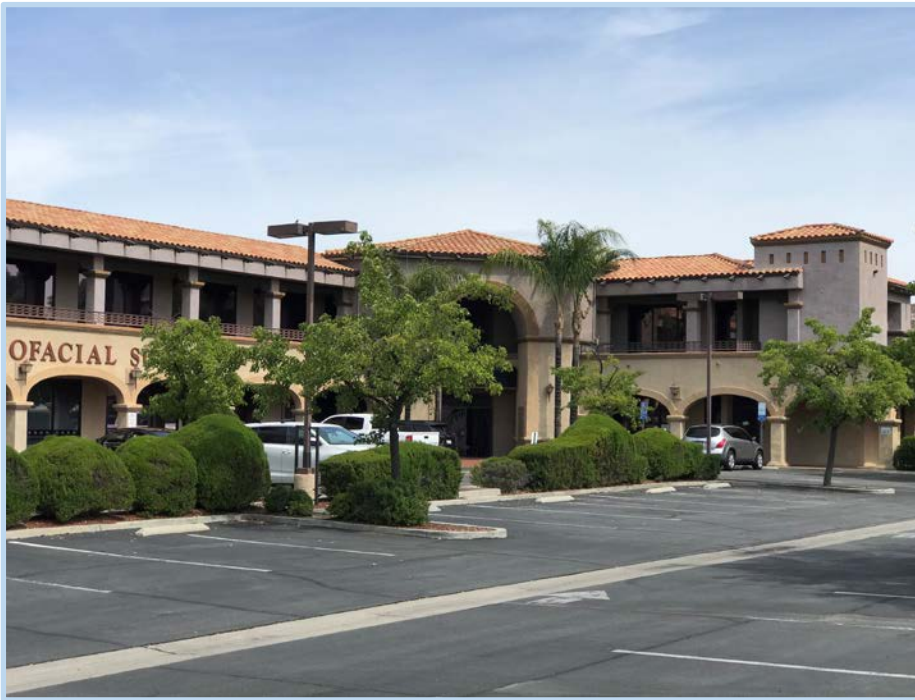
Private, Fenced Parking Lot