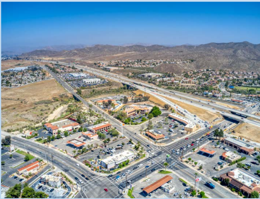
Aerial View to North