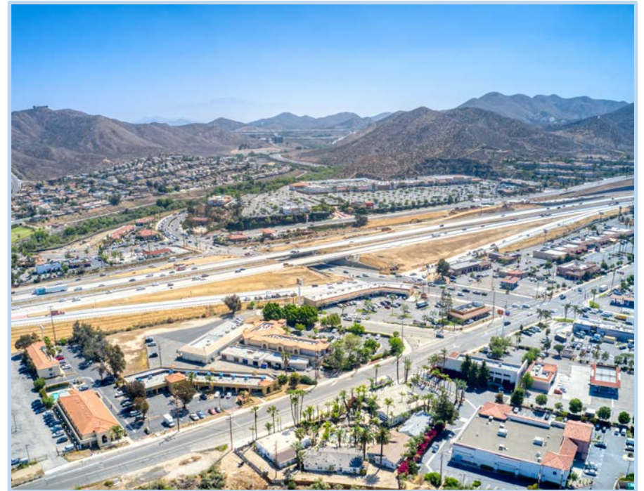
Aerial View to East