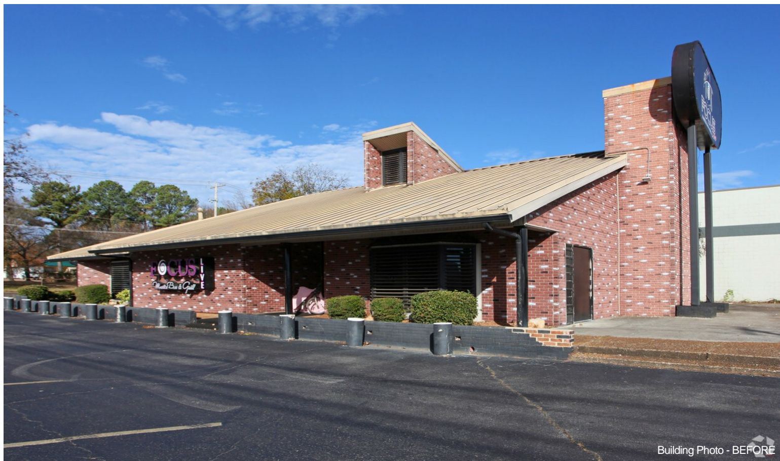
Building Photo - BEFORE