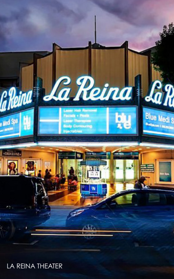
LA REINA THEATER

Sherman Oaks is well-connected to the freeway system, making it easy to navigate the Los Angeles area. The neighborhood is bordered by the Ventura, or 101, Freeway, providing quick access to employment center east to Downtown Los Angeles, and Burbank and west to Tarzana and Warner Center. Additionally, the San Diego, or 405, Freeway is easily accessible, allowing patrons of the property to reach West Los Angeles destinations like Century City, Santa Monica, and Culver City with ease. Sherman Oaks offers access to several public transportation options, enhancing its connectivity to the greater Los Angeles area. The Orange Line Busway, a dedicated bus rapid transit system, runs through Sherman Oaks and connects to the LA Metro Red Line subway system, making it convenient for commuting and exploring the city without a car.