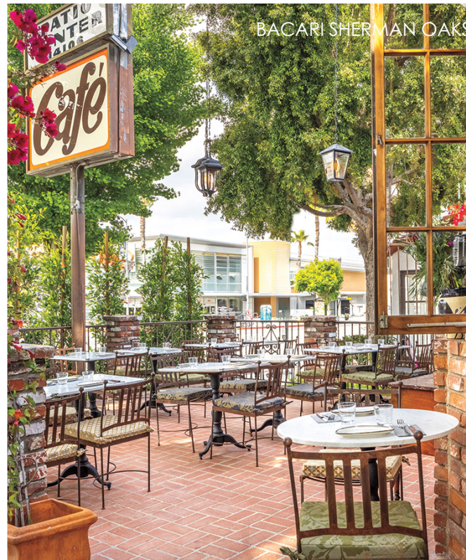
BACARI SHERMAN OAKS