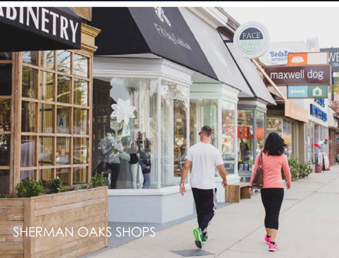
SHERMAN OAKS SHOPS